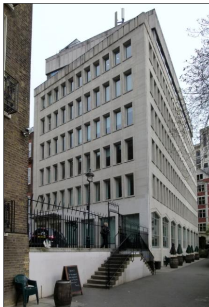
2014 view of present 15 Buckingham Street from Watergate Walk.